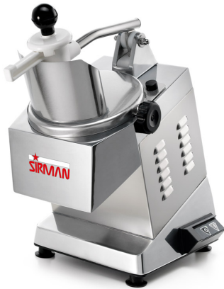
Sirman Vegetable-cutter , model TM Inox :

Sirman Spa Viale dell'Industria 9/11 35010 PIEVE DI CURTAROLO (PD), Italy Tel./Fax. +39 049 9698666 / +39 049 9698688 email: info@sirman.com